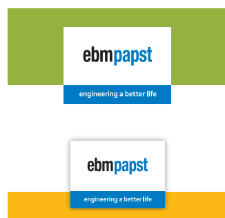
Example with colored area